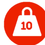
Weight 36 Kg