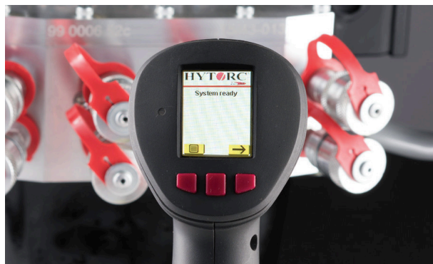
User-friendly digital remote stores specifications for all HYTORC tools.