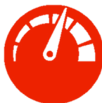
Reservoir Capacity 8 L